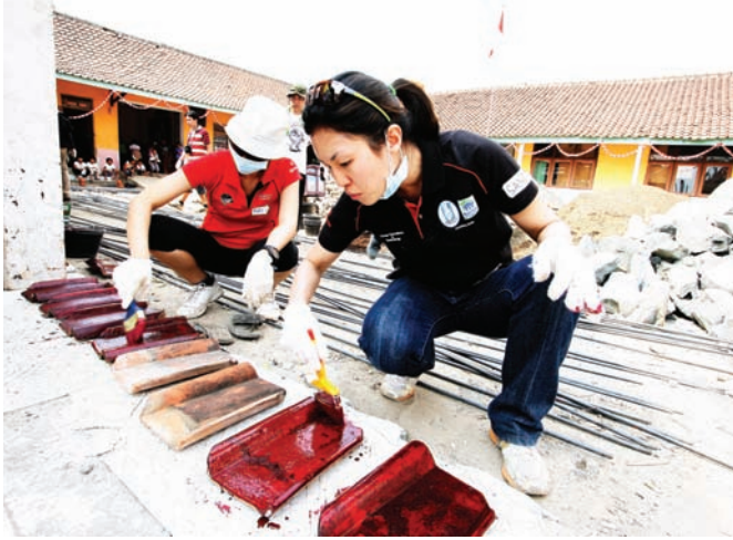
Our Group Operations and Technology colleagues painting the roof tiles of a classroom, part of a community development project to help build houses and a school at Banjaran, Bandung, Indonesia.