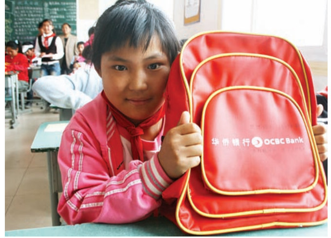
A delighted child from Shi He Primary School in Mianzhu county, China, showing the new schoolbag he received from OCBC. The school, which was destroyed by the Szechuan earthquake, was rebuilt with our donations. The school bags and stationery sets distributed to the children were sponsored by our Group Operations and Technology division.

conducted a financial literacy programme for students at Zi Luo Lan Hope School, and raised funds to donate stationery and a digital camera to the school. In November, several employees from our Human Resources division in Singapore and China donated RMB15,000 (S$3,187) to buy more than 900 books and two bookshelves for Kang Qiao Primary School.