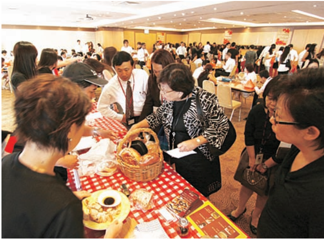
One of several food bazaars organised by OCBC employees to raise funds among our colleagues, for charity.

financial assistance to continue their education despite their families' financial difficulties. Specifically, our contribution was channelled to the NTUC Scholarship Awards and Education Grant.