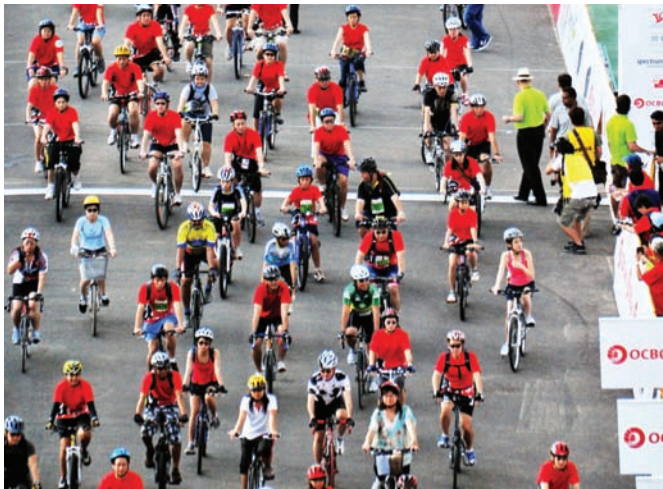
More than 5,400 cyclists took to the roads at OCBC Cycle Singapore 2009, the first mass participation cycling event successfully held for riders of all ages and on closed roads.