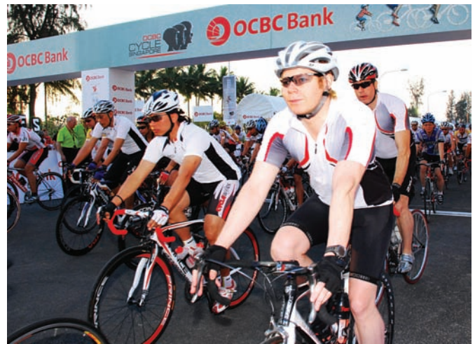
The inclusive nature of cycling and its ability to bring people together are consistent with our value of Teamwork. More than 280 OCBC employees cycled at the inaugural OCBC Cycle Singapore 2009, and many took part in the most popular 40km Challenge category.

A 2.5-km ride for cancer survivors and their friends and relatives, called "Cycle of Hope", will also be added to the event. Participants