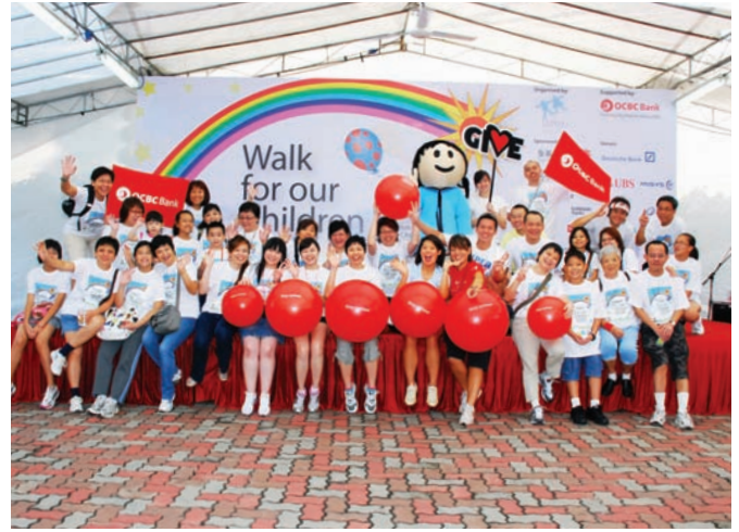
Our employees who participated in the Singapore Children's Society's "Walk for our Children 2009", organised to help to raise S$180,000 for less-privileged children, youth and families.